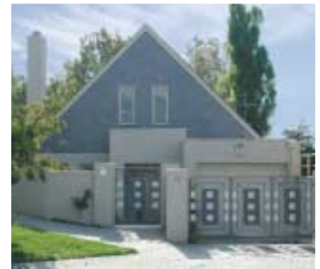
Townhouse, Myrning Crescent, Toorak.

Norman A Faifer and Associates PROFESSIONAL BUILDING & CONSTRUCTION SERVICES