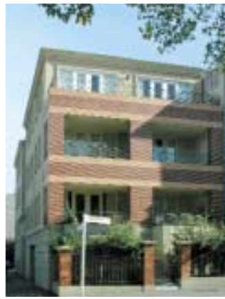
Six Apartments, 42-46 Jolimont Terrace, East Melbourne.