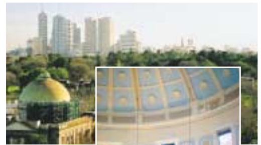
[Above & Right] Melbourne Hebrew Congregation Synagogue Dome Restoration, South Yarra.