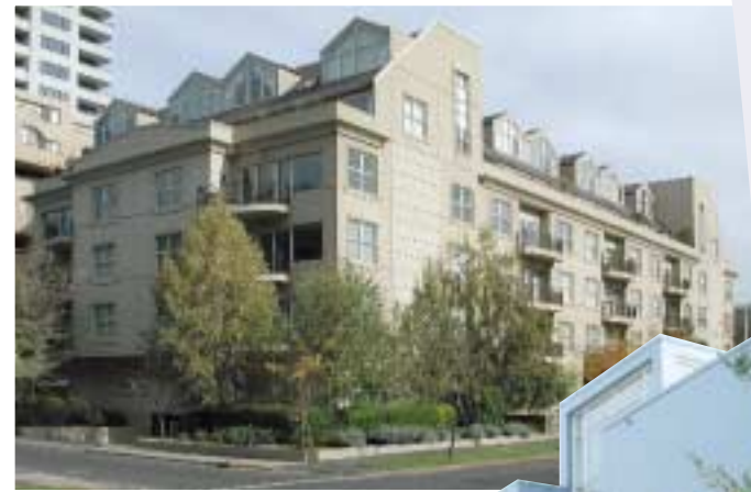
[Above & Right] Sutton Place Apartments, 26 Queens Road, Melbourne.