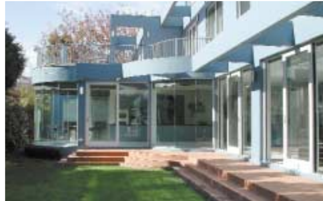
[Far Left, Left & Above] Residence, Caulfield.