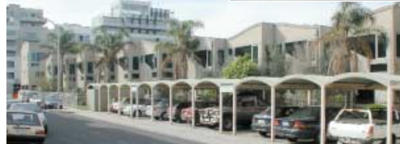
Station Pier Condominiums, 15 Beach Street, Port Melbourne.