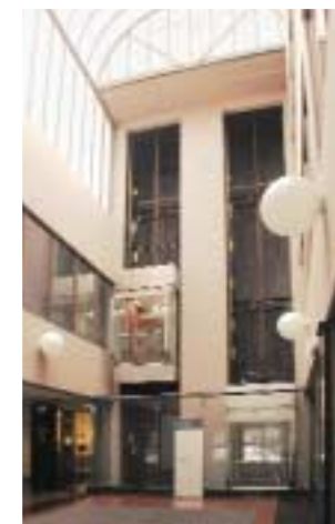
[Left & far Left] Melbourne University I.T. Facility & Public Health Faculty, 723 Swanston Street, Carlton.