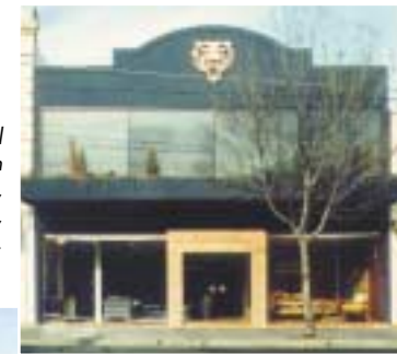
[Right] Retail Showroom & Offices, 718 High Street, Armadale.