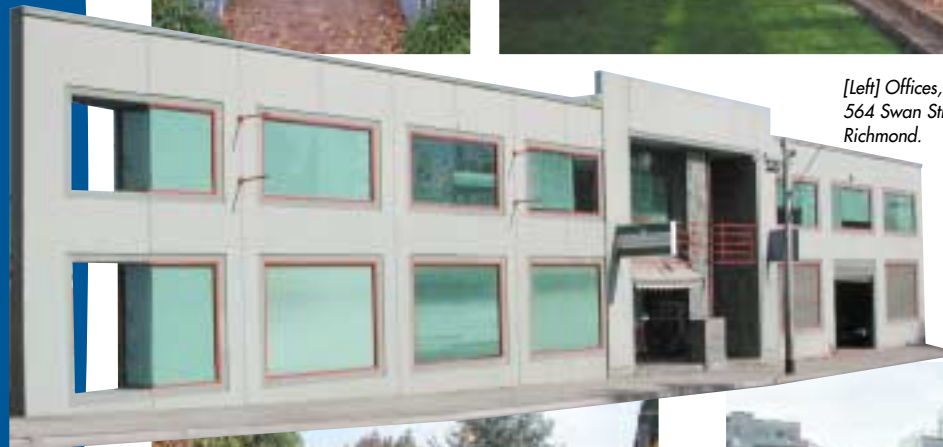
[Left] Offices, 564 Swan Street, Richmond.