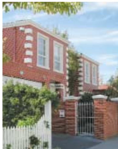
Four Townhouses, 13-15 Valetta Street, Malvern.