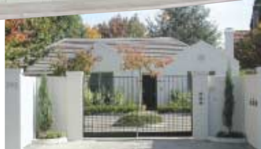
Three Townhouses, 395 Glenferrie Road, Malvern.