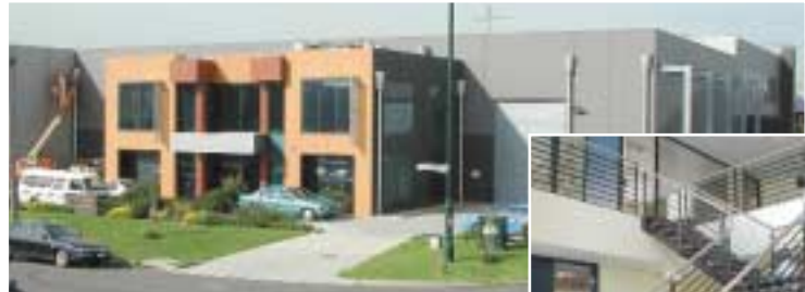
[Above & Right] Office Warehouse, Ingles Street, Port Melbourne.