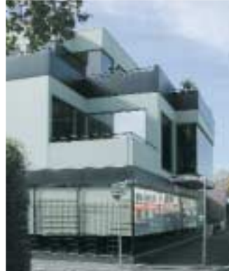
[Above & Right] Three Storey Office Building, 487 Swan Street, Richmond.